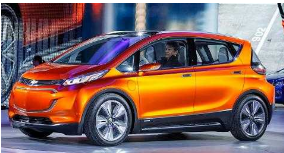
Chevy Bolt Concept EV – 200 Mile range – possibly available mid-2017